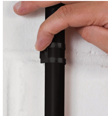
Secure conduit with locking tab