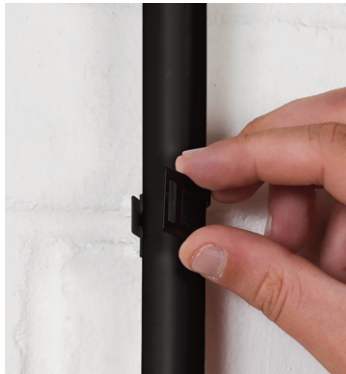
Simply wrap around the conduit, perfect for tight spaces