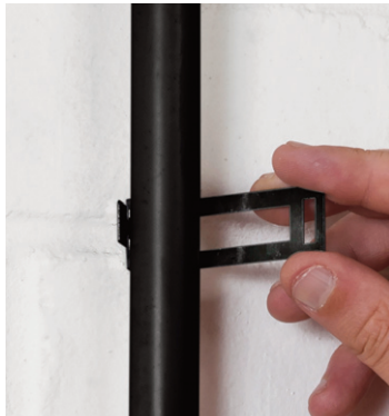
Provides a 3mm stand off from the surface