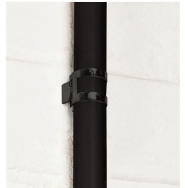
Centralised base fixing, gives a neat appearance to installation

Safe-D Conduit Clips combine fire performance, quickest fix, and a modern look, to secure cables in 25mm outer diameter PVC conduit installations... (or exposed 25mm o/d cables and pipes).