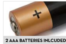
2 AAA BATTERIES INCLUDED