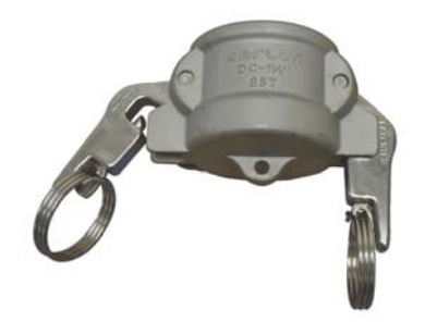
Female Hose Tail SAFLOK Coupler – Part C (e.g. 768-2202)