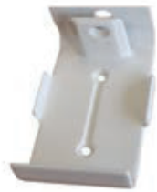
optional wall mounting bracket