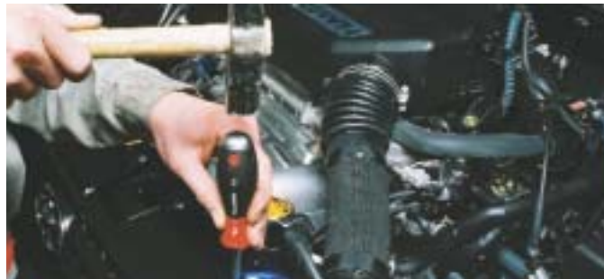
The solid steel cap at the end of the SoftFinish® handle enables controlled hammer blows, for example, when loosening a tight screw.

If a stuck screw has to be loosened, a precise hammer blow can be applied to the solid steel cap. Due to the hex blade extending through the handle to the steel cap, there is no loss of impact energy.