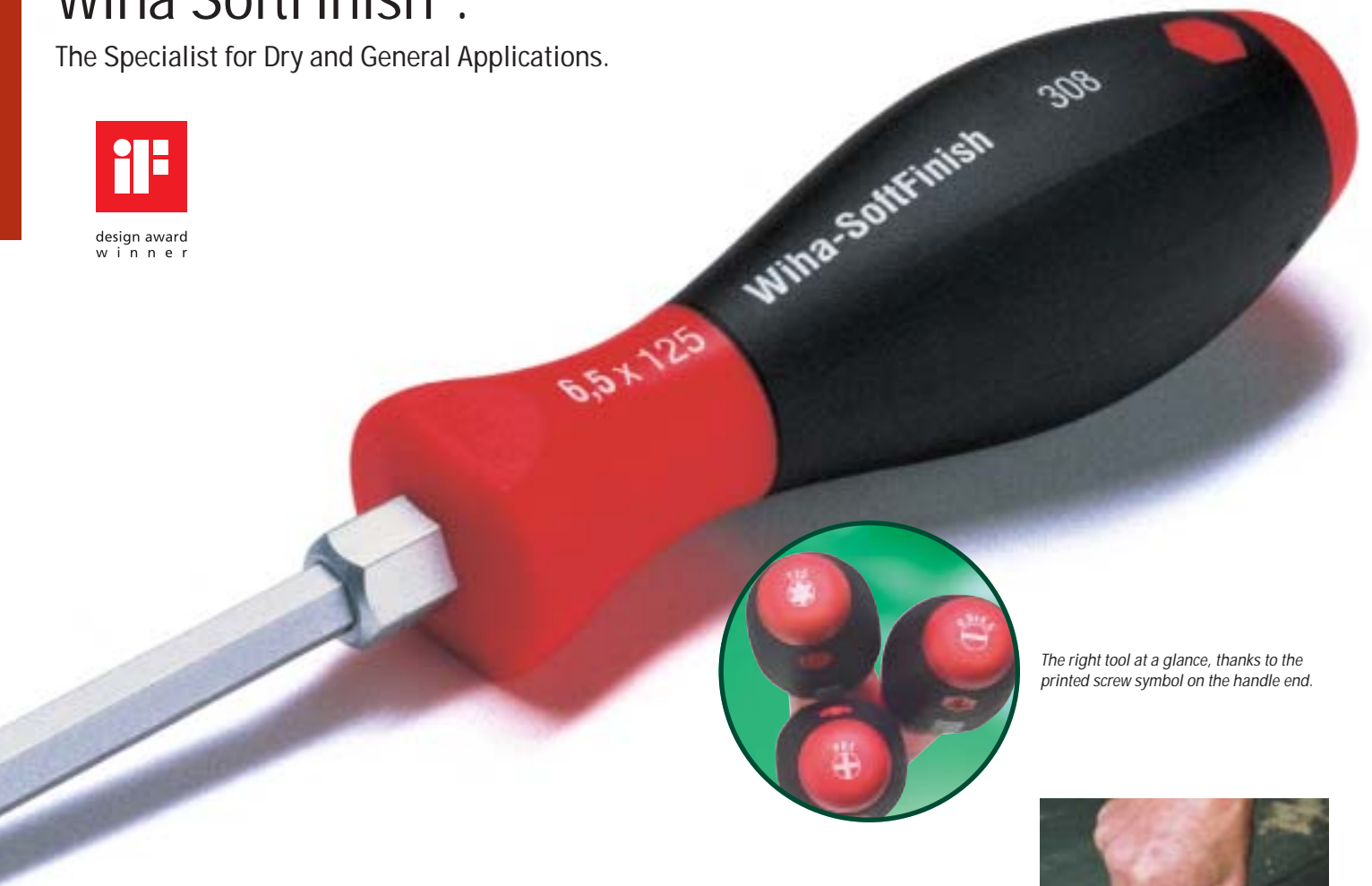
The right tool at a glance, thanks to the printed screw symbol on the handle end.

The Wiha SoftFinish® zone features a solid moulded core with soft outer grip. This requires less force, yet achieves 40% more torque than conventional handles. The handle is shaped to fit comfortably in the hand, providing maximum torque forces in dry and general working conditions.