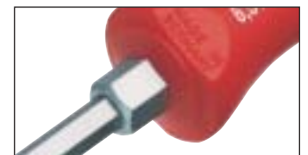
Blade with hex bolster for wrenches to use on particularly tight screws.