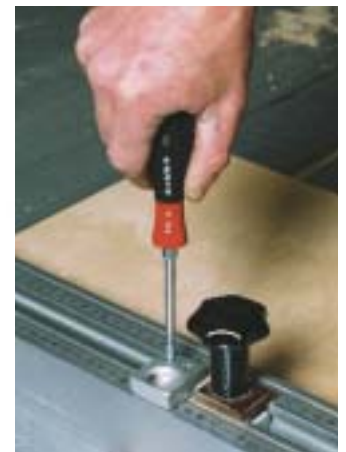
Thermoplastic elastomer tolerates high loads and feels soft and pleasant to the touch.