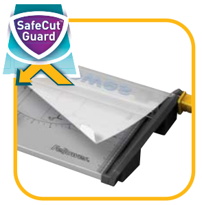
Full size SafeCut <sup>™</sup> Guard prevents mishandling