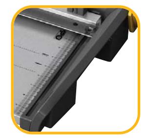
Carry points for easy portability