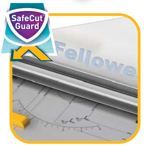
\text{Pre-assembled SafeCut}^{\,{}^{\,\mathsf{TM}}} \,\, \text{guard} prevents setup error