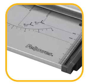
Easy to use cutting guides