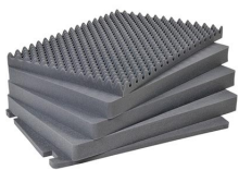
1731 5 pc. Replacement Foam Set