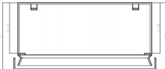
Terminal Box Without Gland Plate