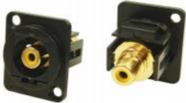
Part No. CP30232MB