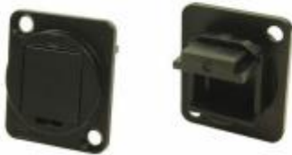
Part No. CP30241MB