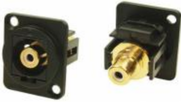
Part No. CP30231MB