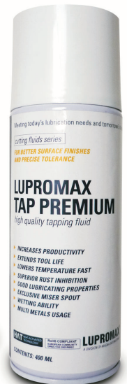
Contents: 400 ml