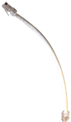
Cat6, RJ45 Plug to RJ45 Plug L=200mm(M)