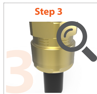
The backnut should be level with the marking guide corresponding to its diameter – this can be visually inspected and adjusted as necessary

Note: The cable gland installation instructions have a printed cable OD measure for if the cable OD is not known