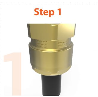
Follow cable gland installation instructions until final stage – tightening of rear seal

The gland is permanently marked with various lines/numbers indicating the correct tightening level related to the cable diameter. Following the relevant cable gland Installation Instructions, the back seal should be tightened until a seal is formed on the cable outer sheath and then tightened one further turn.