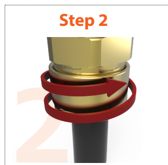
Tighten backnut until a seal is formed onto the cable, then tighten one further turn