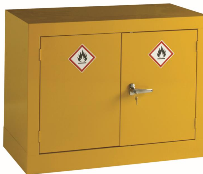
Cabinet Size: H712 x W915 x D459mm