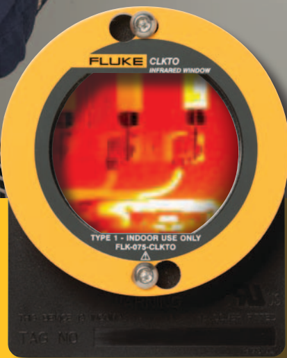
Indoor medium voltage