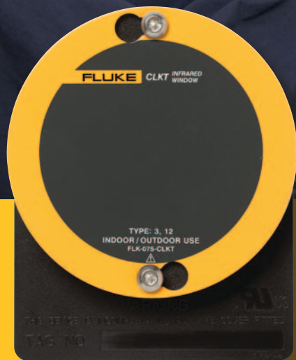
Outdoor/indoor any voltage, arc-tested