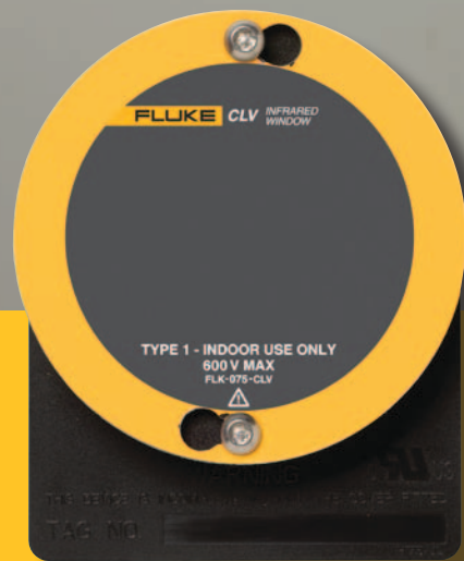
Indoor low voltage