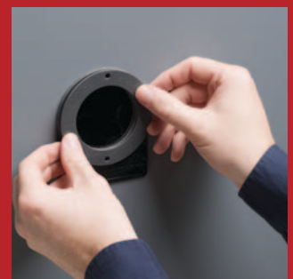
Affix the window

For detailed installation see the UL validated installation instructions supplied