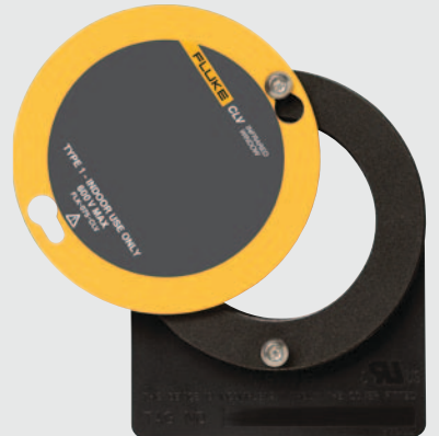
Fluke CLV IR Window for indoor low voltage applications up to 600 V