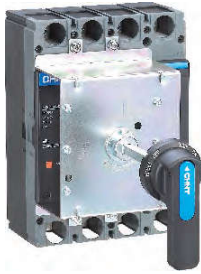
Scheme diagram of assembly of manual operational mechanism with the body