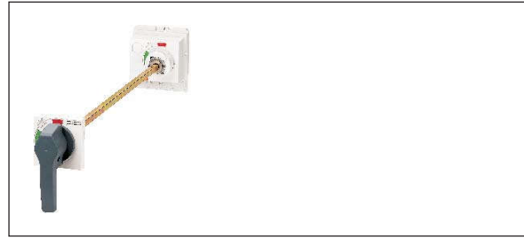
Front boring(fixed or plug-in circuit breaker)(mm)

At "OFF" status, the breaker can be fitted with 1~3 padlocks with a diameter of 5~8mm (by customer). Then door of the switchgear can be opened.