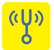
Impact & Vibration