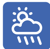
Weather Proof Cable