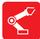
Heavy Industrial Use