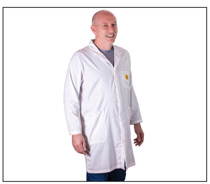
Figure 1. RS Static Dissipative Lab Coat