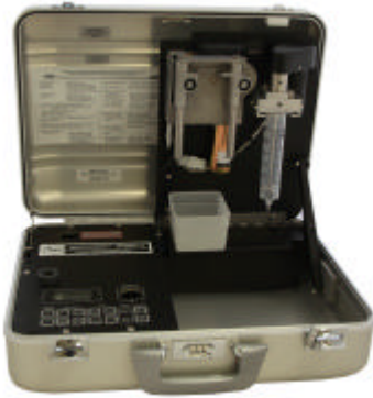
Model 1140 Micro-Separometer™ Water Separation Instrument

The Model 1140 Micro-Separometer™ instrument is a electro-mechanical instrument used to perform four discrete tests.