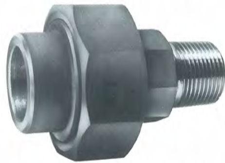
Bocchettoni maschio-femmina Male-female unions