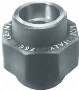
Bocchettoni femmina-femmina Female-female unions