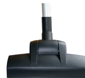
Turbo brush 284 mm Item-No. 106.012