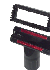
Standard upholstery/ furniture nozzle Item-No. 106.028