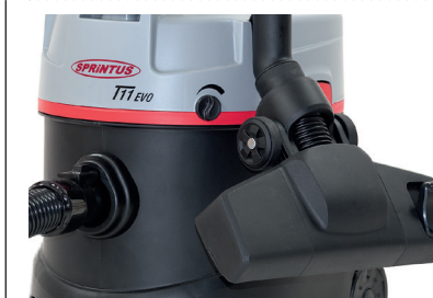
Parking position on both sides of the motor head.