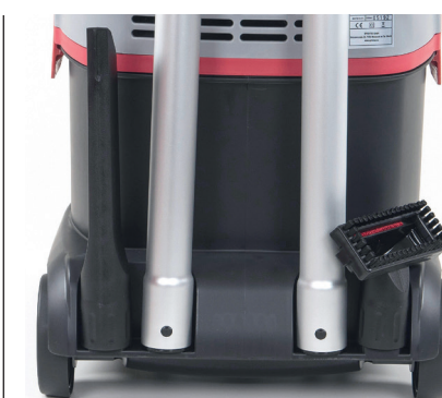
Four storage slots for accessories on the backside.