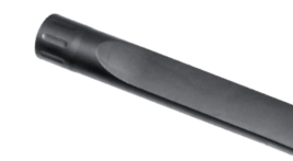
Standard crevice nozzle 230 mm Item-No. 101.023