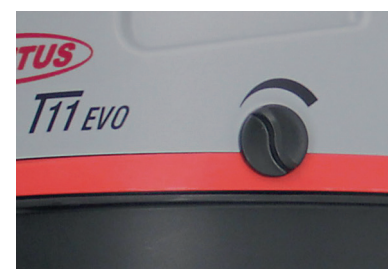
Power regulator for adjusting the vacuum to any surface.