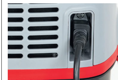
new Improved comfort: black, pluggable 10 m power cord.