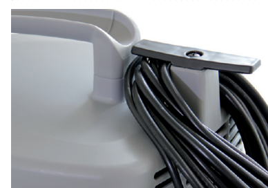
Large, lockable cable hook.