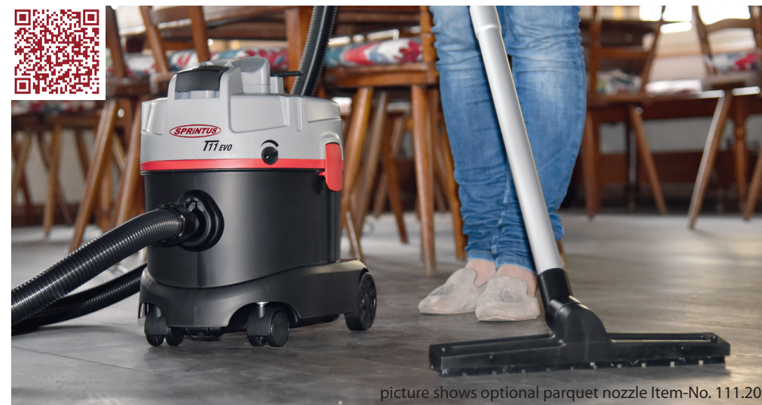
picture shows optional parquet nozzle Item-No. 111.202