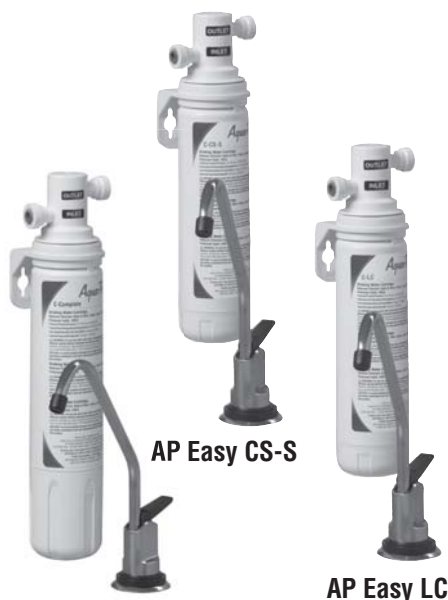
AP Easy Complete