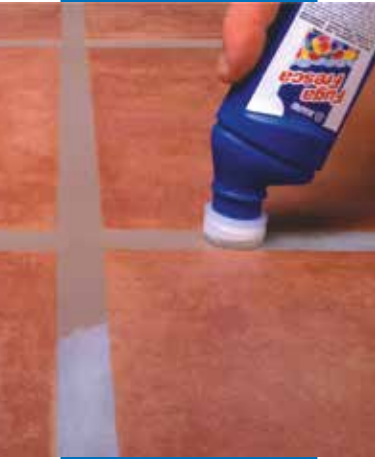
Floor in terracotta treated with Fuga Fresca