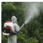
Chemical Reach Distance Horizontal spray distance of 14 meters, Vertical Spray distance of 10 meters.