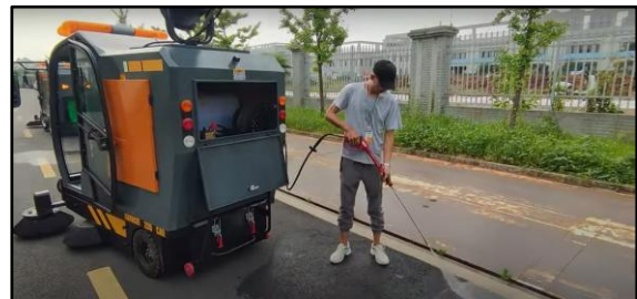
In-built High Pressure Washing System

Sweeping Width: 2050mm Productivity: 15,000m 2 /h Max Climbing Capacity: 20-25%