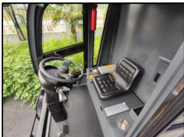
Ergonomic Seat and Steering