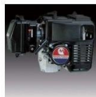
KAWASAKI TK65 This proven "KAWASAKI TK" engine is designed with Kawasaki's new air-head scavenging method, which conforms to exhaust emission regulations in the USA and Europe.