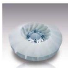
Turbo Fan Maruyama's Turbo fan makes for high air capacity with superior efficiency.

*2 Guaranteed sound power level EC directive 2000/14/EC, ISO11694