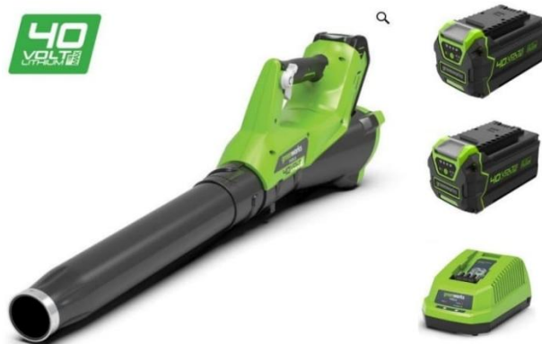
GREENWORKS G40AB 40VOLT AXIAL G-MAX BLOWER