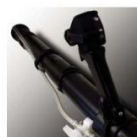
Mist Nozzle Assembly Ideal for a wide variety of spraying jobs.