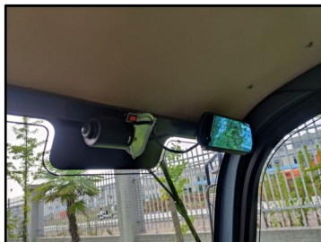
Rear View Mirror