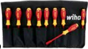
In Roll-up Pouch