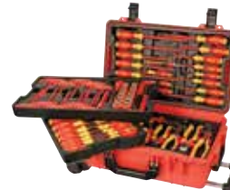
Rolling Water Tight Traveling Tool Box