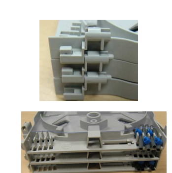
2524SR side view