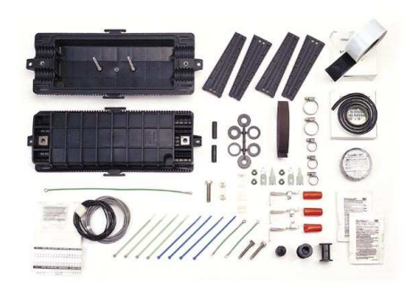
Parts of closure