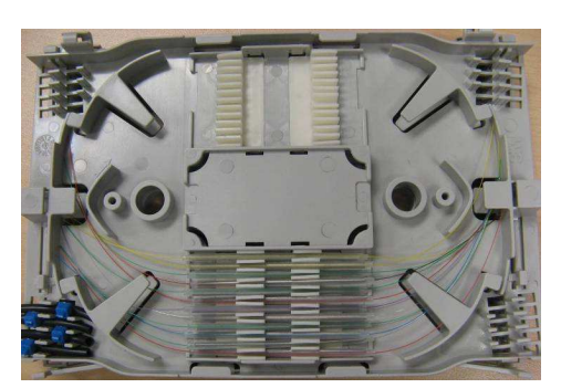
2524SR top view