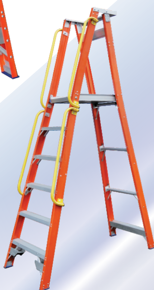
PROPFshr Side Hand-Rails