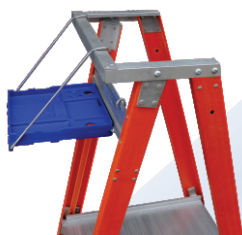
PROPTT Platform Tool Tray