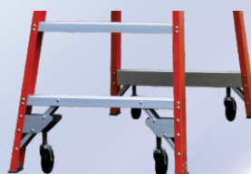
PROPWK Platform Wheel Kit