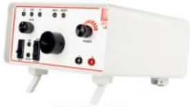
L60 Fine Wire Thermocouple Welder

The Thermocouple Welder is a compact, simple-to-use instrument designed for thermocouple and fine wire welding. Supplied with foot switch, spare electrodes, pliers & safety glasses, impact clip and pen plate.