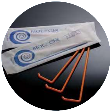
Individually plastic packaging