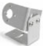
Mounting bracket (RS Stock No. 905-8777)