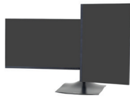
DS100 Dual-Monitor Desk Stand Horizontal