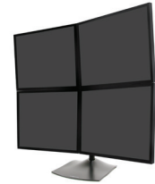
DS100 Quad-Monitor Desk Stand