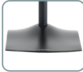
SLEEK, LOW-PROFILE BASE WITH DURABLE FINISH PROVIDES STABILITY AND SAVES SPACE.