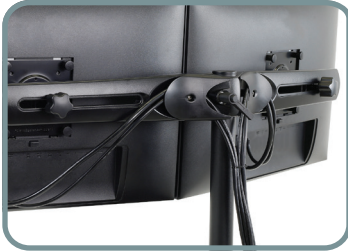
CABLES ARE GUIDED CLEANLY THROUGH CABLE CHANNELS