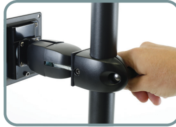
MONITOR HEIGHT CAN BE ADJUSTED ON POLE (33-091-200 SHOWN). 28" POLE (20-137-200) ALSO AVAILABLE, ORDER SEPARATELY.