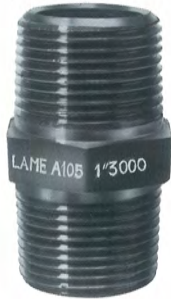
Nippli esagonali Hex. nipples