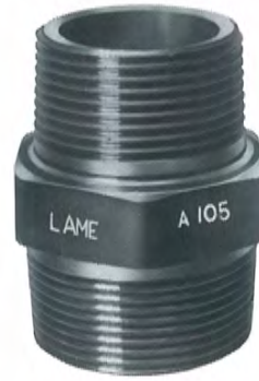
Nippli esagonali ridotti Reducing hex. nipples

Nota: Per i nippli ridotti la quota "B" è quella del \varnothing minore.