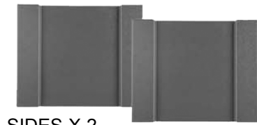
SIDES X 2