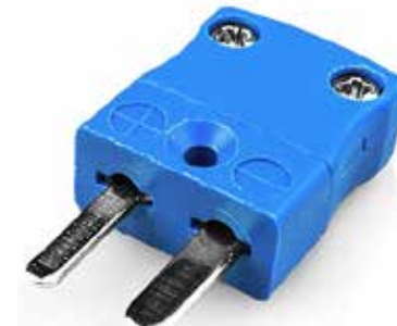
A IEC Miniature Plug