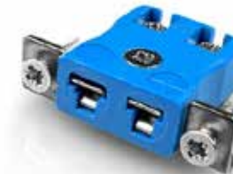
A IEC Miniature Quick-wire Panel Mount with Stainless Steel Bracket