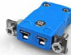
A IEC Miniature Panel Mount with Stainless Steel Bracket