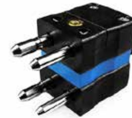
A IEC Standard Duplex Plug