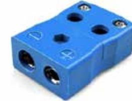
A IEC Standard Quick-wire Sockets