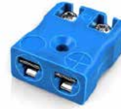
A IEC Miniature Quick-wire Sockets