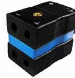
A IEC Standard Duplex Socket