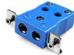
A IEC Standard Quick-wire Panel Mount with Stainless Steel Bracket