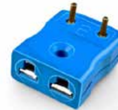
A IEC Miniature PCB Socket