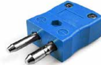
A IEC Standard Plug