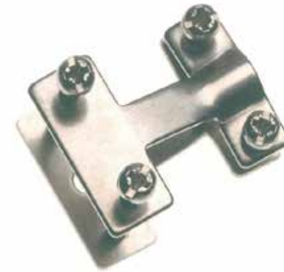
A Miniature/Standard for Fascia Sockets Panel