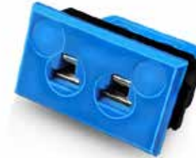
A IEC Miniature Rectangular Fascia Socket