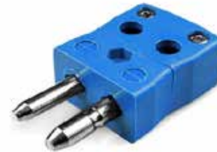
A IEC Standard Quick-wire Plugs