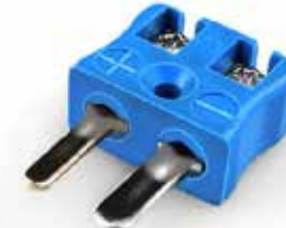
A IEC Miniature Quick-wire Plugs