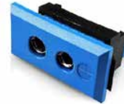
A IEC Standard Fascia Sockets