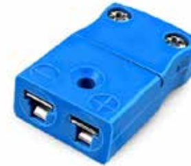
A IEC Miniature Socket