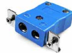
A IEC Standard Panel Mount with Stainless Steel Bracket