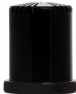
Acoustic warning device.