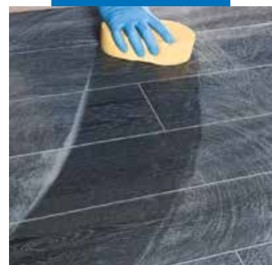
Cleaning and finishing the joints with a hard cellulose sponge