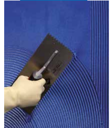
Spreading blue Kerapoxy Design used as an adhesive with notched trowel