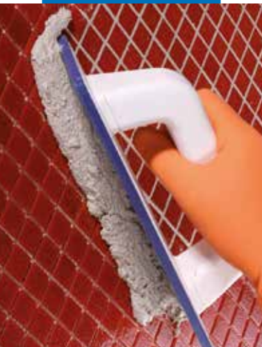
Application of Kerapoxy Design

Floors are ready for light foot traffic after 24 hours at +20°C.