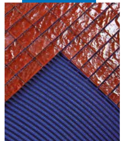
The following day, grouting with Kerapoxy Design in the same colour and the same application procedure previously shown