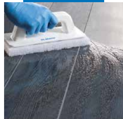
Cleaning the joints with a Scotch-Brite® pad