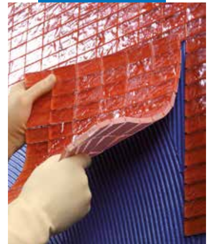
Laying glass mosaic with Kerapoxy Design on wall