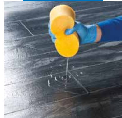
Wetting the grouted surface prior to cleaning