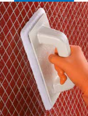
Cleaning off the glass mosaic with a damp Scotch Brite® pad