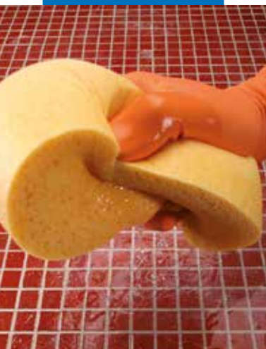
Wetting the surface of the grout before cleaning