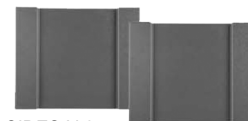
SIDES X 2