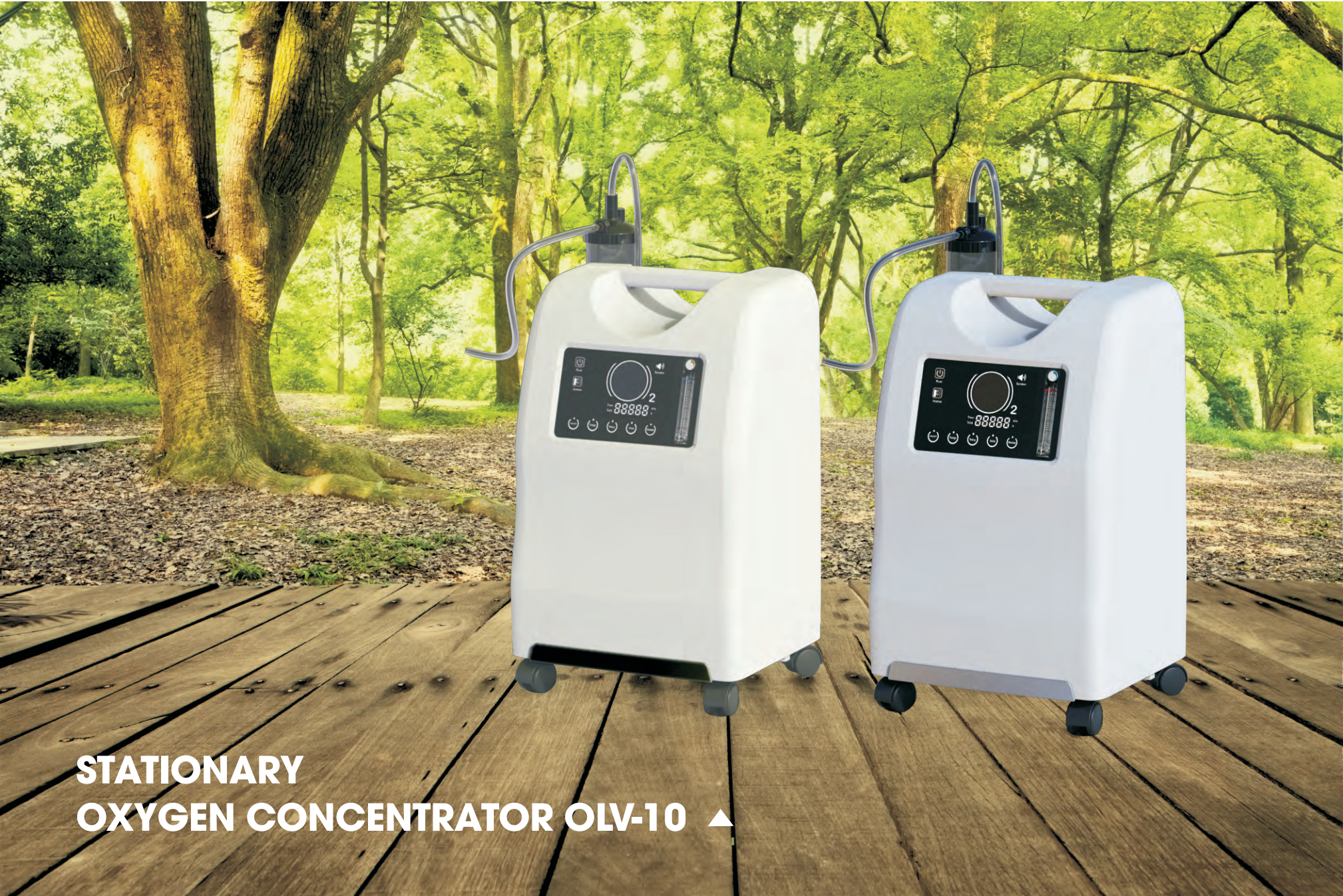
STATIONARY OXYGEN CONCENTRATOR OLV-10 ▲