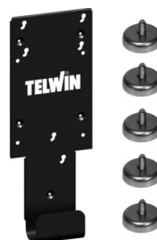
HOLDING BRACKET KIT 803086