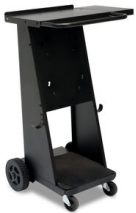
TROLLEY - DIAGNOSTIC 803077