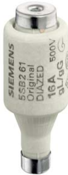
DIAZED FUSE LINK 500V F.CABLE AND LINE PROTECTION OP.CL.GL,SZ.DII,THREAD E27,16A