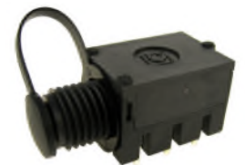
Black socket showing hole seal.

IEW = isolated earth washer CEW = connected earth washer