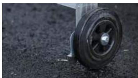
With two large diameter wheels Tracker moves easily over sealed and unsealed surfaces.