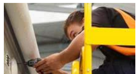
StockMaster TrackerPro features a Safety Rail system that can be adjusted to your task.

StockMaster Tracker is a modular design enabling parts replacement in the event of accidental damage. It is manufactured from high-quality materials and built to last. With reasonable care StockMaster Tracker will give many years of service, and get the job done.