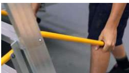
Tracker is easier and faster to move around and saves time on the job.