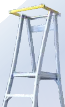
PROPG Platform Gate