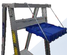
PROPTT Platform Tool Tray