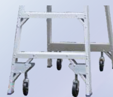
PROPWK Platform Wheel Kit