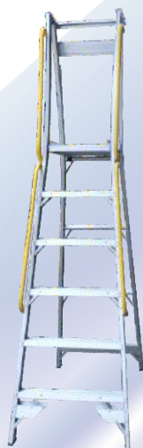
PROPSHR Side Hand-Rails