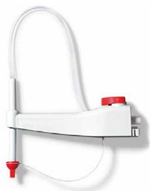
Titrating tube with screw cap and integrated discharge and recirculation valve

Find more information on the Titrette® and suitable accessories at shop.brand.de