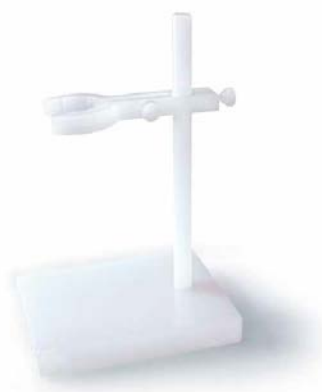
Bottle Stand PP. Full plastic construction. Support rod 325 mm, base plate 220 x 160 mm, weight 1130 g