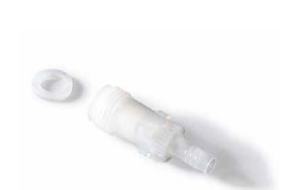
Filling valve with olive-shaped nozzle and sealing ring