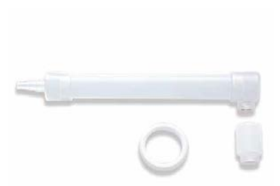
Drying tube Drying tube and seal, without drying agent