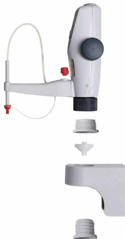
Extraction system for Titrette® extraction system for Bag-in-Box for ready-to-use volumetric solutions