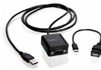
Adapter set interface interface RS232 to USB for Titrette®