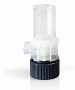
Dispensing cylinder with valve block