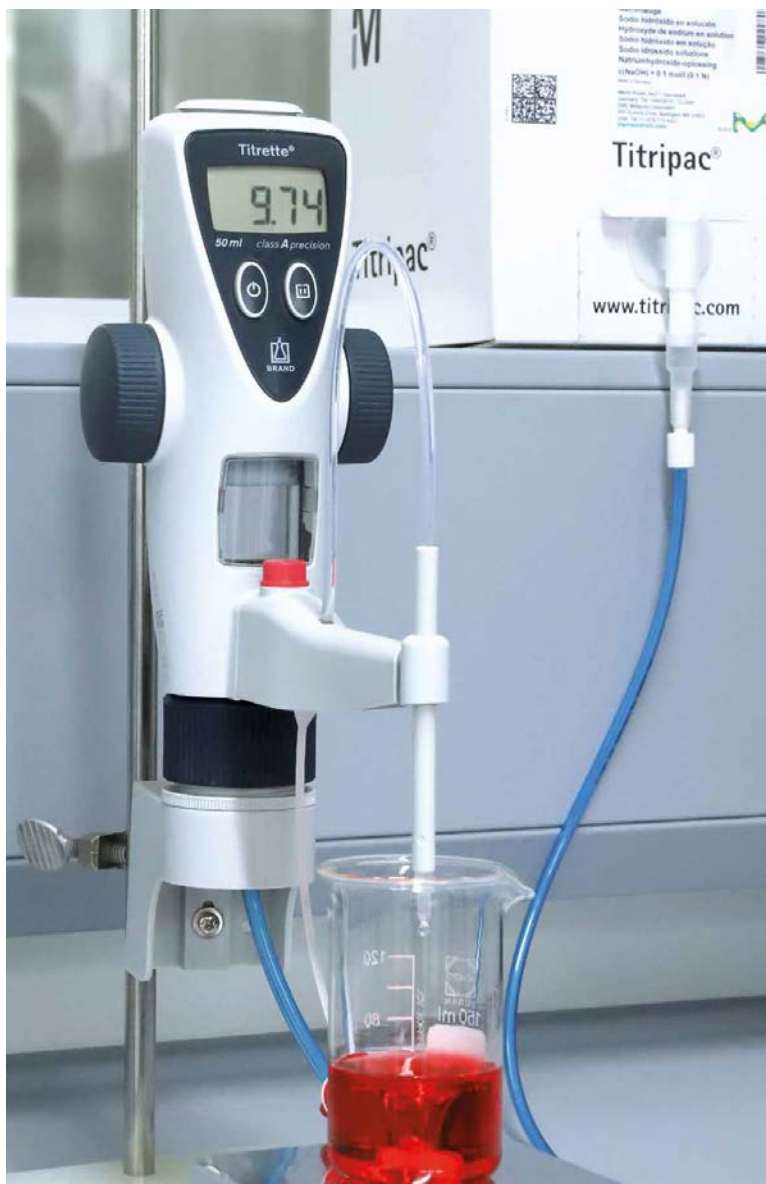
Titrette® extraction system for Bag-in-Box (Titripac® is a registered trademark of Merck KGaA, Darmstadt, Germany)