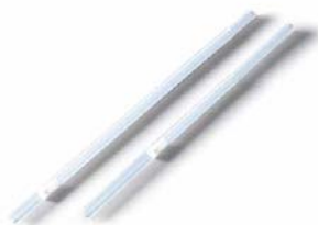
Telescoping filling tube FEP