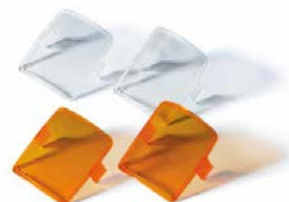
Inspection window 1 set colorless and 1 set amber colored (light shield)