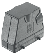
Hood side entry with double lever