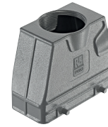
Hoods top entry with double lever