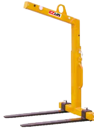
CY Series Self-balancing head