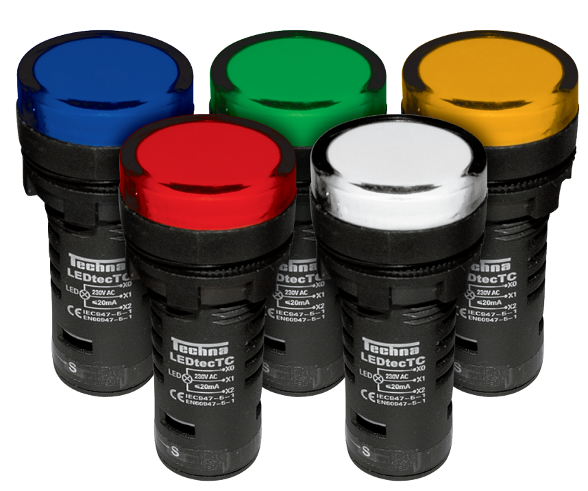
Representative of range