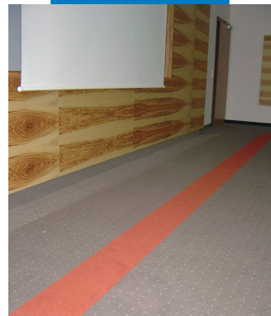
Example of Primer G applied before spreading on Ultraplano Eco and Rollcoll adhesive, used to bond carpet in a hotel room - Villa Hotel Castellani - Austria