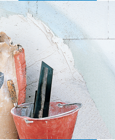
Use as a primer for gypsum plasters