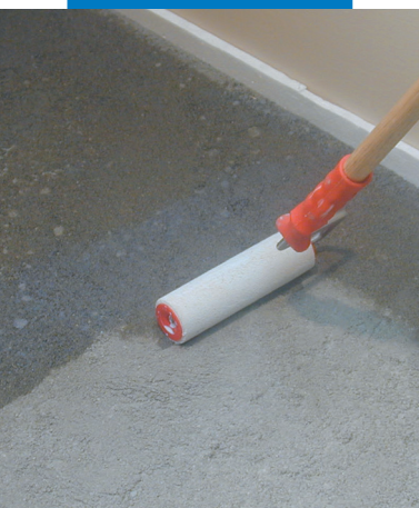
Applying Primer G with a roller