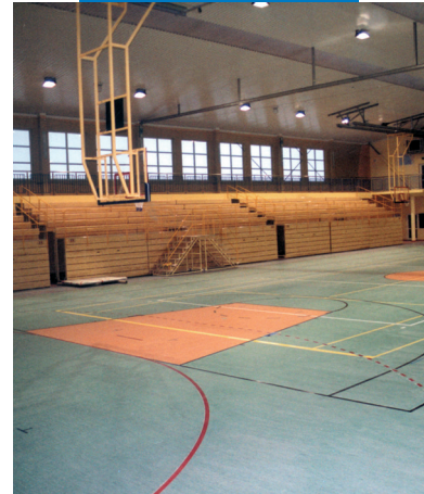
Example of Primer G applied before laying PVC and linoleum in a public gymnasium - Gdansk Orunia Indoor Gymnasium - Poland

All relevant references for the product are available upon request and from www.mapei.com