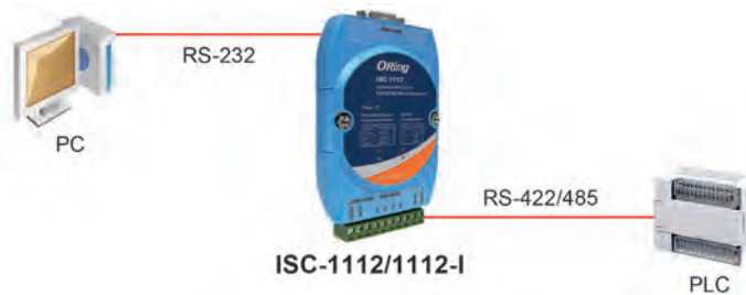
Connections of Serial Media Converter

ISC-1112 series are industrial media converters provide media conversion between RS-232 and RS-422/485 interface. ISC-1112 series are ABS housing design and supporting an operating temperature of -10 to 70°C. The RS-485 control is completely transparent to the user and software written for half-duplex operation without any modification. ISC-1112-I opto-isolators provide 3000VDC of isolation to protect the host computer from destructive voltage spikes. Therefore, the ISC-1112 series is reliable serial media converter and can satisfy most demand of operating environment.