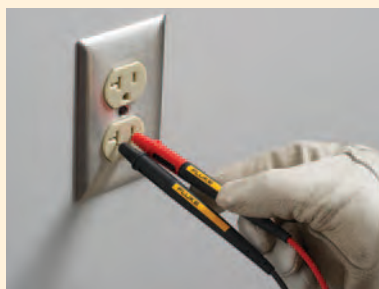
Increase tip exposure for CAT II probing