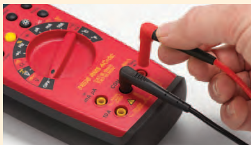
Universal plugs compatible with all 4 mm shrouded inputs