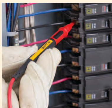
Reduce tip exposure for CAT III testing