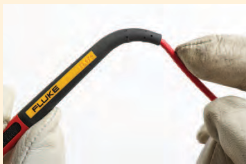
Extreme strain relief tested to withstand over 30,000 bends